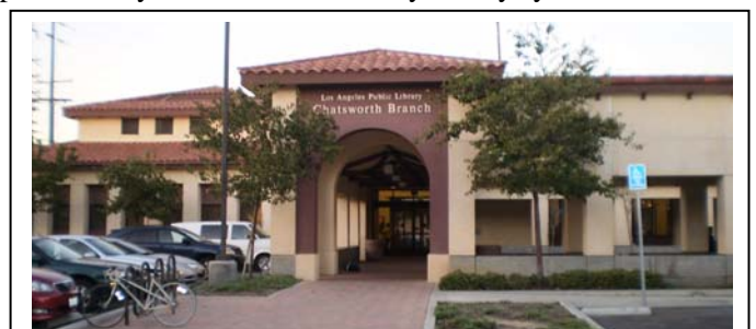
2009 Photo of Chatsworth Branch Library parking lot entrance

In 1998 funds were approved for adjacent land and an expanded building on the existing site. In June 2002, ground breaking began for the new building, while a temporary library was opened at the Chatsworth Train Station that housed a small portion of books allowing local patrons easy access to the LA City library system.