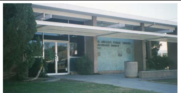
1970 Photo of Chatsworth Branch Library built in 1963

From 1952-1963 the Chatsworth community was serviced by the LA Public Library Bookmobile Program. The bookmobile made scheduled stops throughout the valley, stopping here across the street from the Chatsworth Park Elementary School.