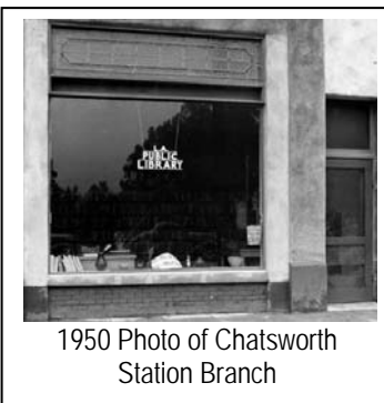
1950 Photo of Chatsworth Station Branch

which is in the Crisler Building, once located on the southeast corner of Devonshire and Topanga. The features above the windows correspond to that building at that time. The location was on Devonshire, before the hardware store moved to that section of the building.