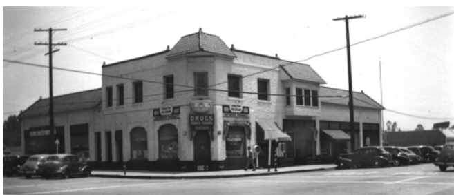
1949 Photo of Crisler Building, library would have been on the left facing Devonshire in about 1950.