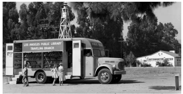
1952 Photo of Bookmobile in Chatsworth -- note Chatsworth Chamber/Women's Club building in background on Topanga.

From 1952-1963 the Chatsworth community was serviced by the LA Public Library Bookmobile Program. The bookmobile made scheduled stops throughout the valley, stopping here across the street from the Chatsworth Park Elementary School.